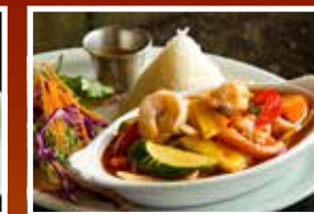
Sweet & Sour Shrimp