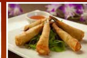
Shrimp In The Blanket