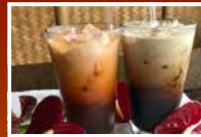
Thai Tea & Thai Coffee