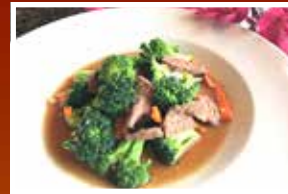
Oyster Sauce Broccoli