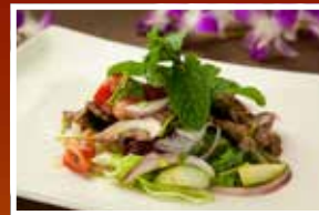
Grilled Beef Salad