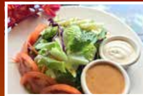
House Green Salad