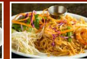
Phad Thai Shrimp