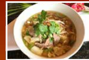
Beef Noodle soup