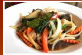
Eggplant Lover Basil