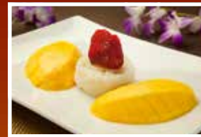
Sticky Rice w/ Mango