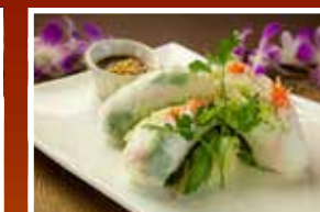
Fresh Basil Rolls