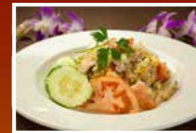
Thai Fried Rice