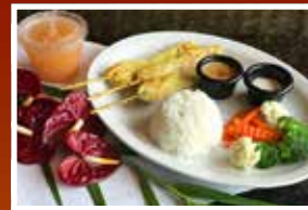
Keiki Chicken Satay