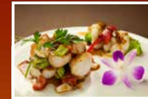
Garlic Shrimp and Scallops