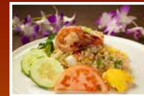
Shrimp Fried Rice