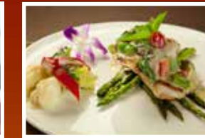
Green Curry Fish