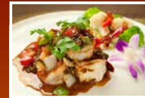
Grilled Jumbo Shrimp

Maximum 3 separate checks per table. Prices subject to change without notice. Pictures above may vary slightly from actual dishes.