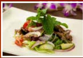
Grilled Beef Salad