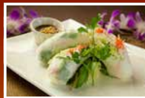
Fresh Basil Rolls