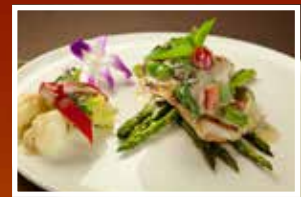
Green Curry Fish