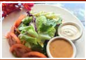
House Green Salad