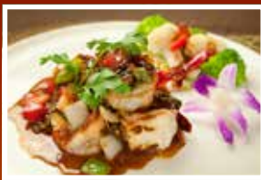
Grilled Jumbo Shrimp