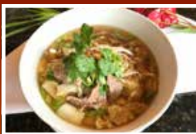
Beef Noodle soup