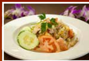
Thai Fried Rice