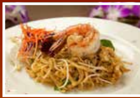
Shrimp Pad Thai