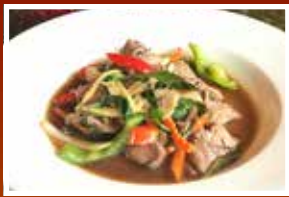
Queen of Siam Basil