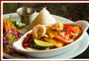
Sweet & Sour Shrimp