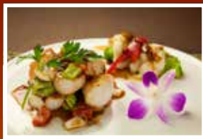
Garlic Shrimp and Scallops