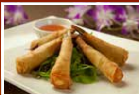
Shrimp In The Blanket