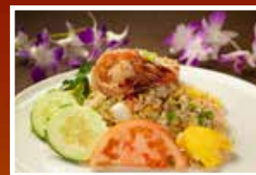
Shrimp Fried Rice