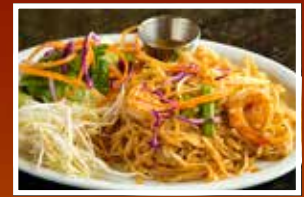
Phad Thai Shrimp