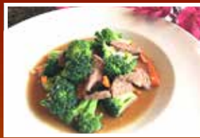
Oyster Sauce Broccoli